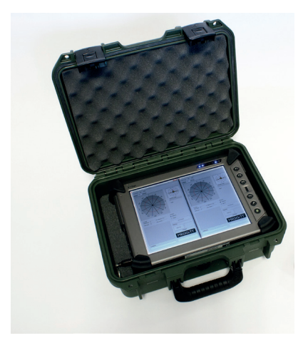
Compact, powerful system for accurate assessment.

being installed by the user at the commencement of each trial/mission.