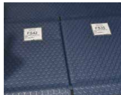
Lightweight composite armor for flight deck, cargo, door and other areas

Our specialty ultra-high-hard steel plate and processing techniques allow for fabrication of complex geometries that would otherwise be unattainable. Stringent testing has shown that QNA's metallic armor solutions exceed ballistic performance requirements and are flight proven on both US and international aircraft platforms.