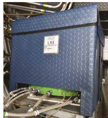
Easy to apply LOX Armor solutions