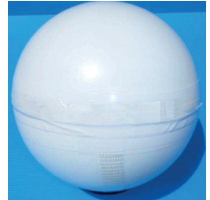
Proven design with no moving parts ensures reliable operation and no power requirements

Note: Due to continuous process improvement, specifications are subject to change without notice